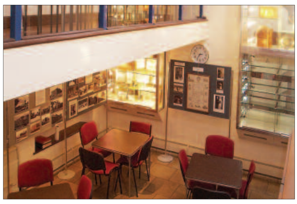
HERITAGE CENTRE SHOWING PART OF LOWER FLOOR AND PART OF GALLERY