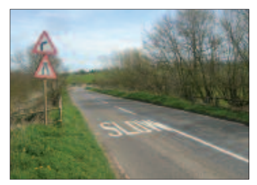
Approaching bridge from Spratton

The increasingly real and potential dangers of the very narrow Spratton Road Bridge will be well known to local drivers; dangers frequently worsened by the low level mist which hangs around that area in the early mornings and evenings.