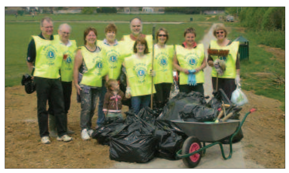
Lions litter pick team