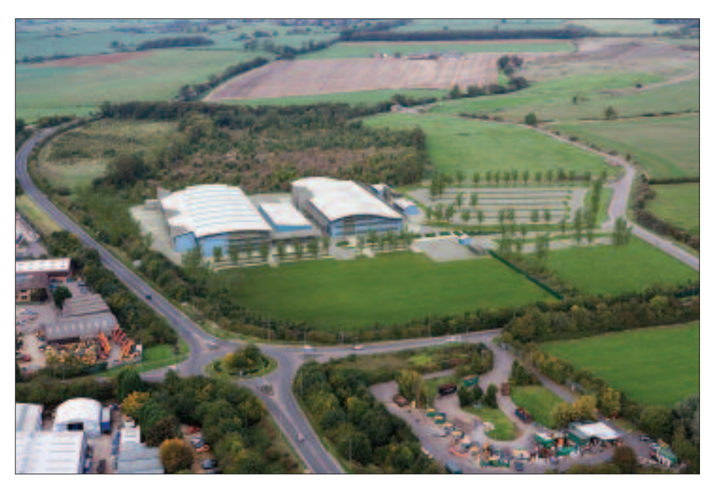
ARTIST'S IMPRESSION OF COMPLETED DEVELOPMENT